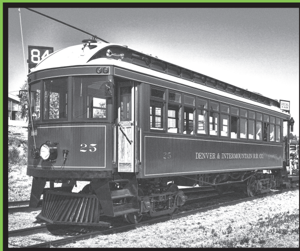
Denver and Intermountain railroad car #25